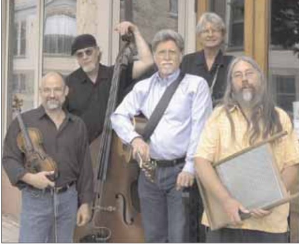
Piper Road Spring Band

Plans are taking shape for the Wabeno Art & Music (WAM) Fest on Saturday, August 5th. In its third year the full day of activities features live music on two stages, art gallery, "plein air" competition, "arty" activities for kids, mini art and music workshops, unique and traditional-festival food, drinks, art and 50-50 raffles and more. The event runs from 10 a.m. to 10 p.m. in historic downtown Wabeno, Highway 32 in Forest County.